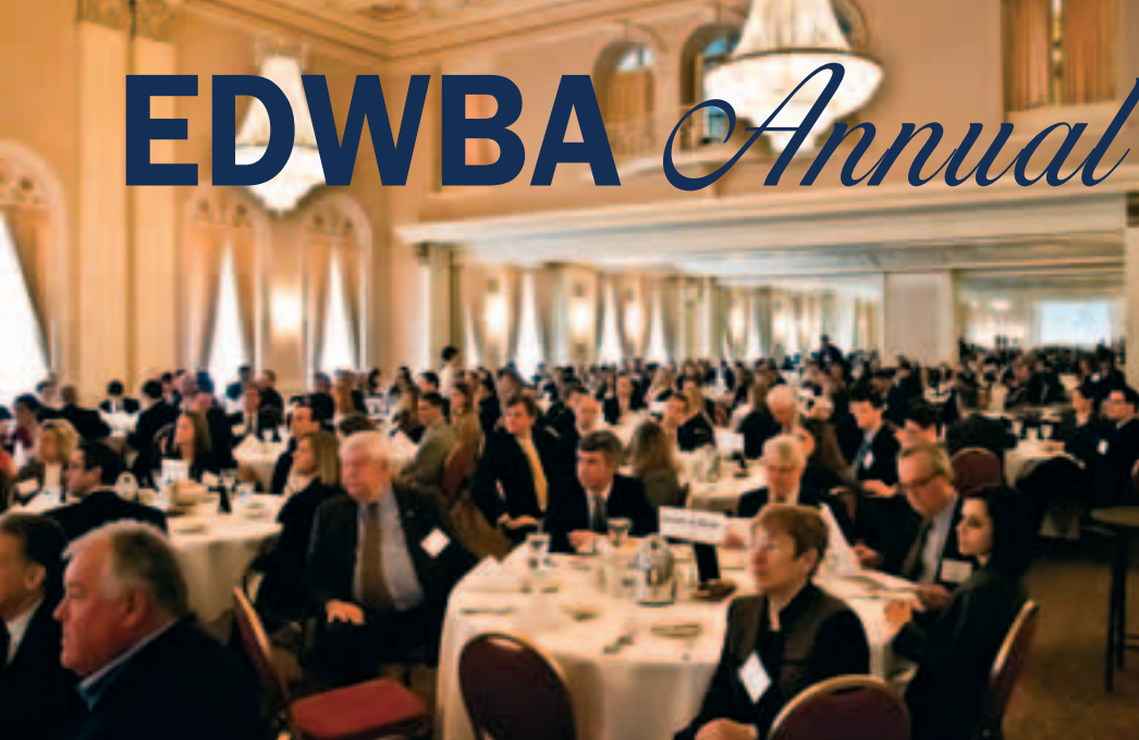
Over 250 people attended the EDWBA's Annual Meeting luncheon on April 25, 2013. ▲