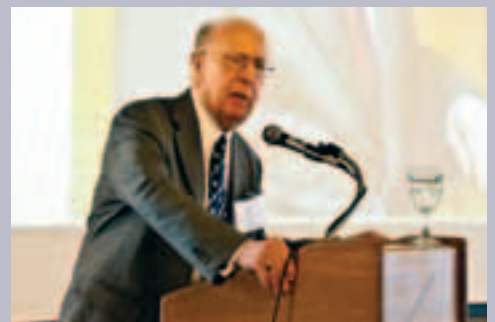
▶ The Honorable William J. Bauer, U.S. Court of Appeals for the Seventh Circuit, gives the luncheon keynote at the EDWBA's Annual Meeting. ▲