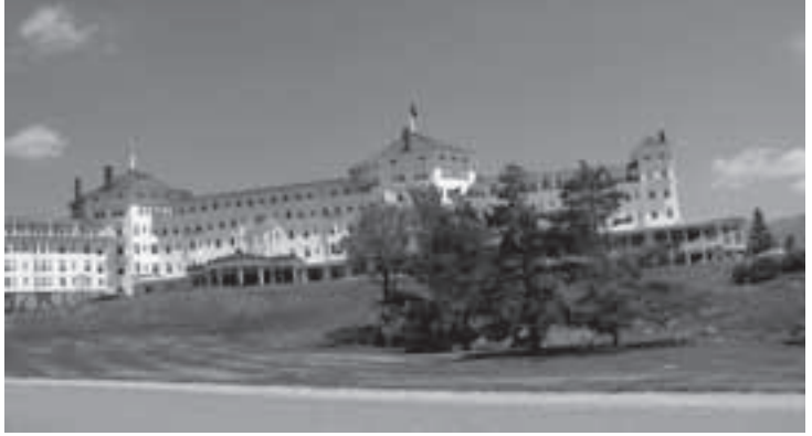
Mount Washington Hotel, NH (site of the Bretton Woods monetary and financial conference, 1944)

In 2010, my CLE account took me to Concord, New Hampshire for an ethics course involving environmental issues. I continued north to Mount Washington, east to Waterville, Maine and on to the Franklin