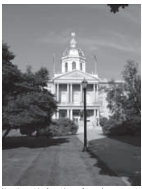
New Hampshire State House, Concord

Clearly, I needed a plan. Destination CLEs are hardly a new thing. We get brochures and solicitations for them all the time. So I got out my Rand-McNally. I had six states still to visit, and many interesting places appeared to be a short drive from cities likely to host a course I might take. I even resolved to make use of the time in the car by listening to law-related audio books.