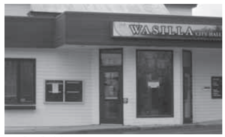
City Hall, Wasilla, Alaska

Afterwards, I followed the Alaska Pipeline to Valdez, doubled back and continued on to Palmer, and then to Seward and Homer in the Kenai Peninsula.